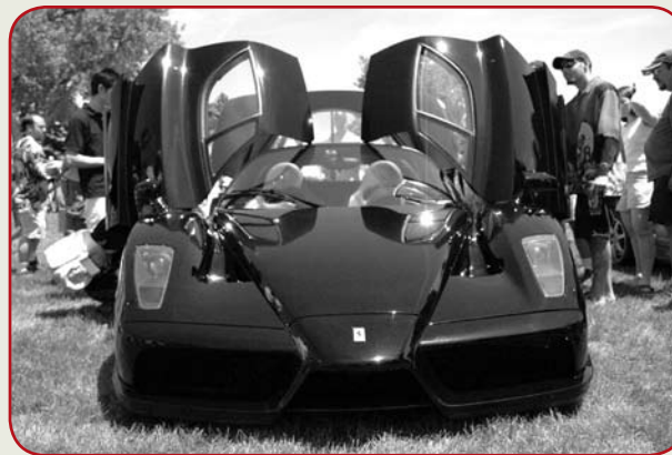
One of the more popular cars on display was this incredible Ferrari Enzo valued at over $1,000,000

The 23rd Annual Exotic Car Show & Concours D'Elegance was a huge success with attendance at the event topping 8,000 people and raising over $75,000! Adults and children alike marveled at over 320 cars worth over $22,000,000. The car show, which first debuted in 1983, benefits Cerebral Palsy of Colorado's Creative Options Early Education Programs. The show was held Sunday, June 4, 2006 at the Arapahoe Community College, Littleton, Colorado.